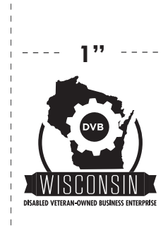
minimum size for logo placement

The minimum logo Size is 1 inch wide placed proportionally.