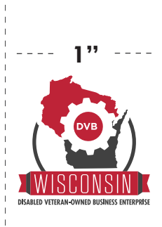
minimum size for logo placement