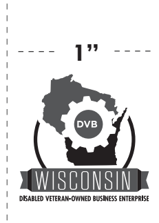
minimum size for logo placement