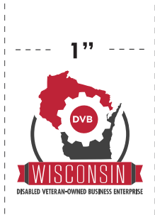
minimum size for logo placement