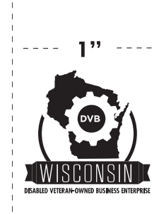
minimum size for logo placement

The minimum logo size is 1 inch wide placed proportionally.