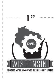
minimum size for logo placement